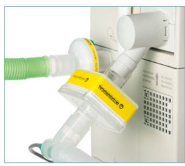
Airway Management • Breathing Filters