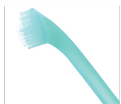
Targeting Ventilator Associated Pneumonia