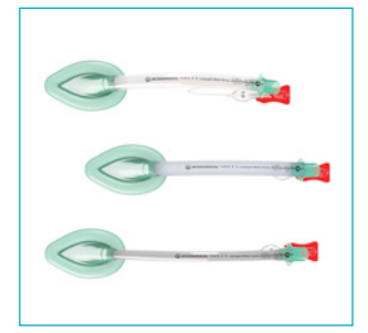
IS6.4 • Issue 8 06.24