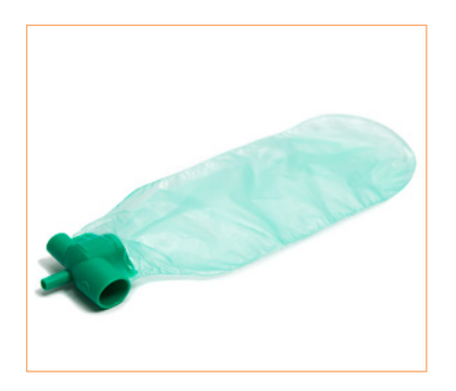
Oxygen and Aerosol Therapy • Oxygen Therapy